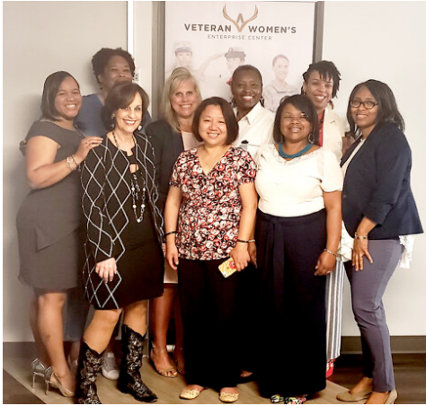
A few of the partners of Veteran Women's Enterprise Center